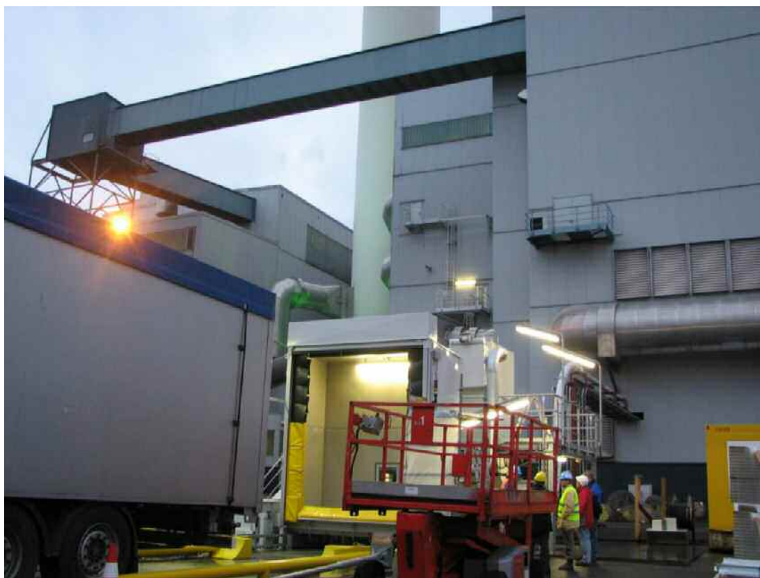
Figure 5 Walking-floor unloading and compact collection point at the power plant Flensburg

Especially for the adjustment of the control and regulation technology, the co-combustion started in January 2007 envisages a slowly increasing feeding curve. At the time of the report about 3 Mg RDF/h are co-combusted. The continued planning includes decoupling the acceptance and feed of RDF into a warehouse; currently this is put out to tender.