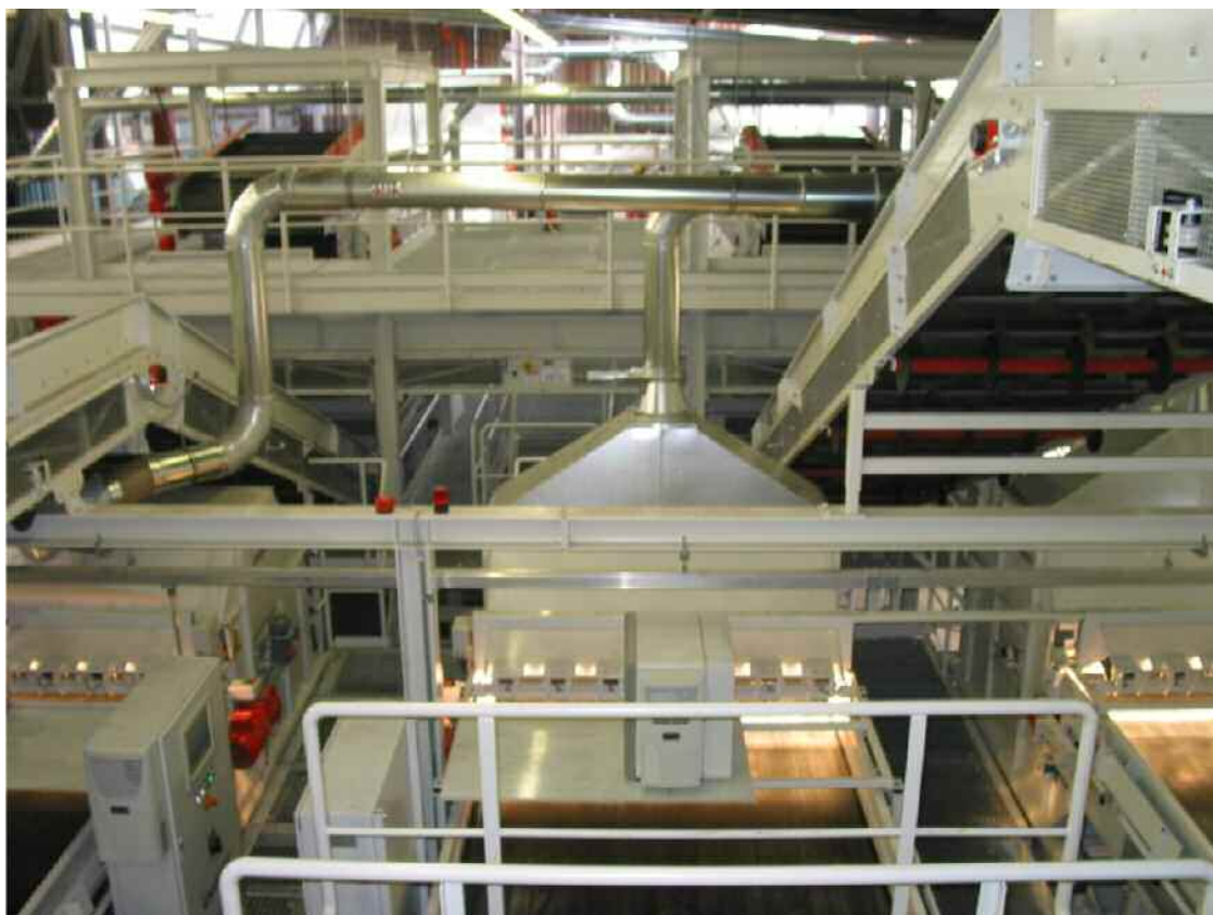
Figure 3 Plant floor with 3 of 4 NIR separators

The portions of heavy lift from the wind sieves are gathered in order to also be, after completing metal separation, automatically separated with a NIR device (positive sorting) from the fuels still contained (e.g. hard plastics, wood). While the mainly mineral remainders are deposited, the fuels proceed to the processing line for the coarse light fraction. The mingling is carried out prior to proceeding to NIR separator, so that the share of fuel in the heavy lift again is negatively sorted for PVC.